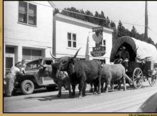
Above - Louie's Chicken Hut and neon outdoor sign at 568 Main Street.