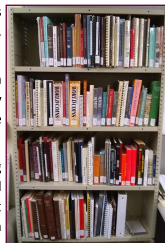
Photo of the donated resources