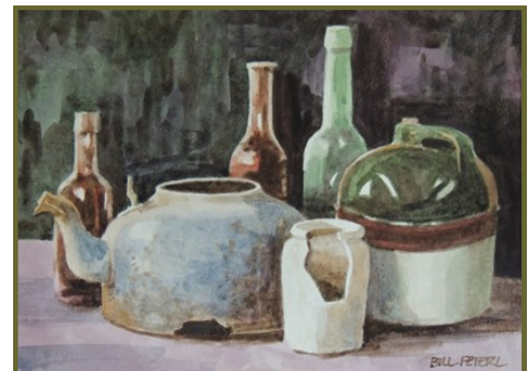
Lost & Found II