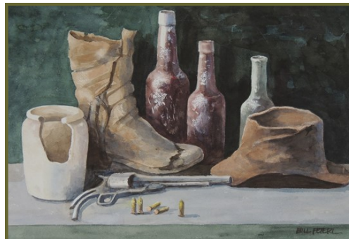
Lost & Found I